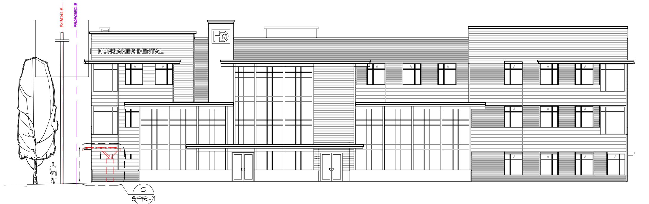
A NORTH ELEVATION SPR-10 SCALE : 1/16" = 1'-0"