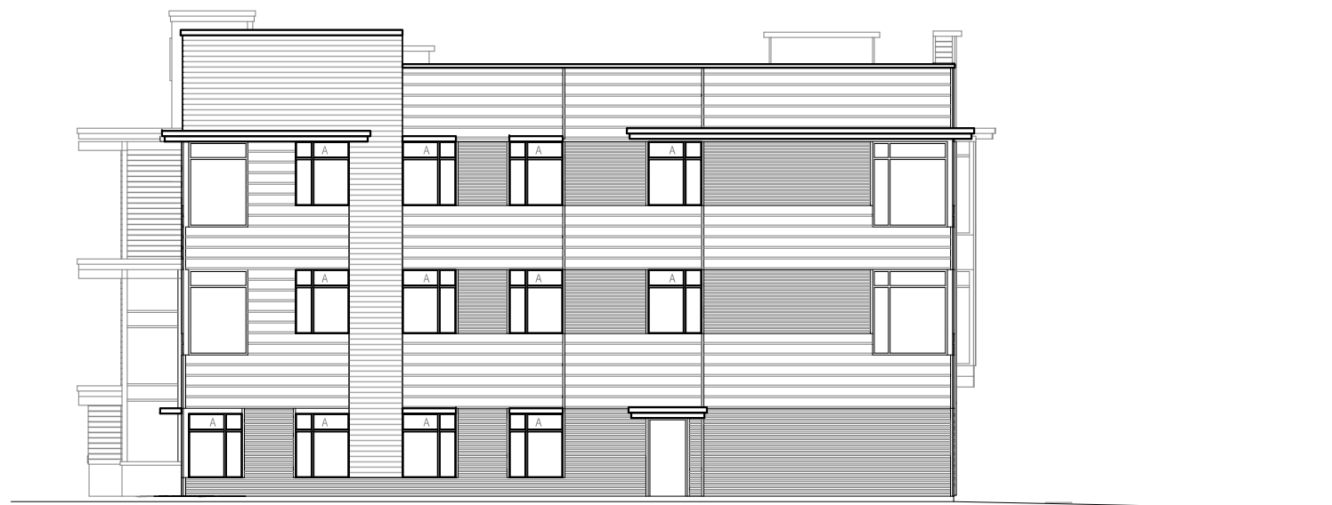
B WEST ELEVATION SCALE : 1/16" = 1'-0"