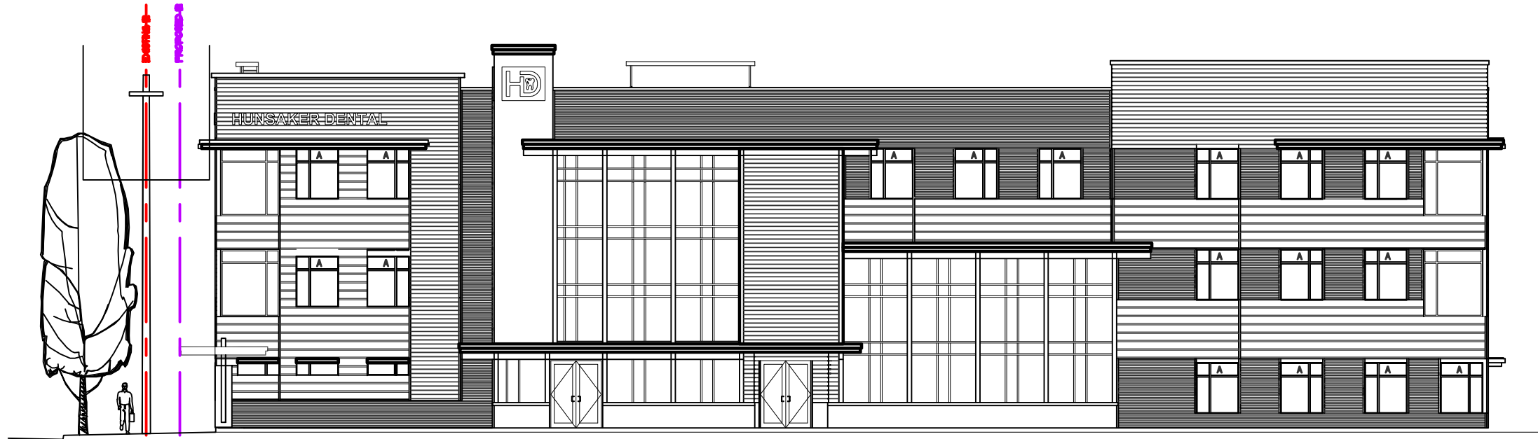
A NORTH ELEVATION SPR-10 SCALE : 1/16" = 1'-0"