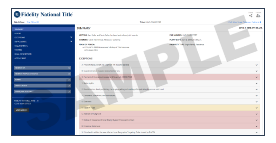
Effortless, Efficient, Compliant, and Accessible

To view your new Fidelity National Title LiveLOOK report, Click Here