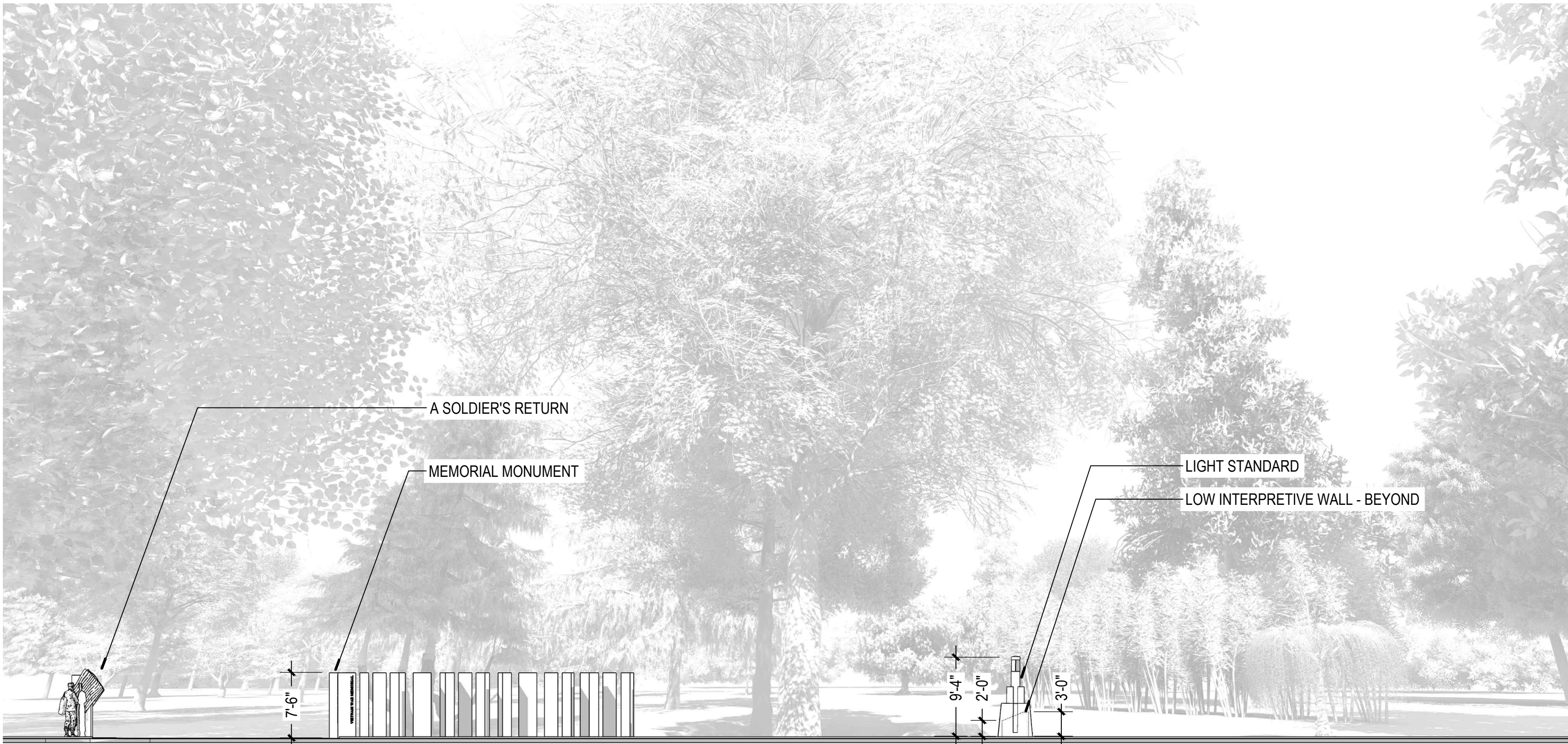
1 SITE ELEVATION - ELEMENTS WITHIN 10' OF RIGHT-OF-WAY VIEW FROM STATE STREET LOOKING NORTH