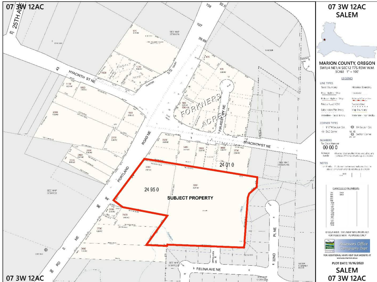
EXHIBIT A TAX MAP