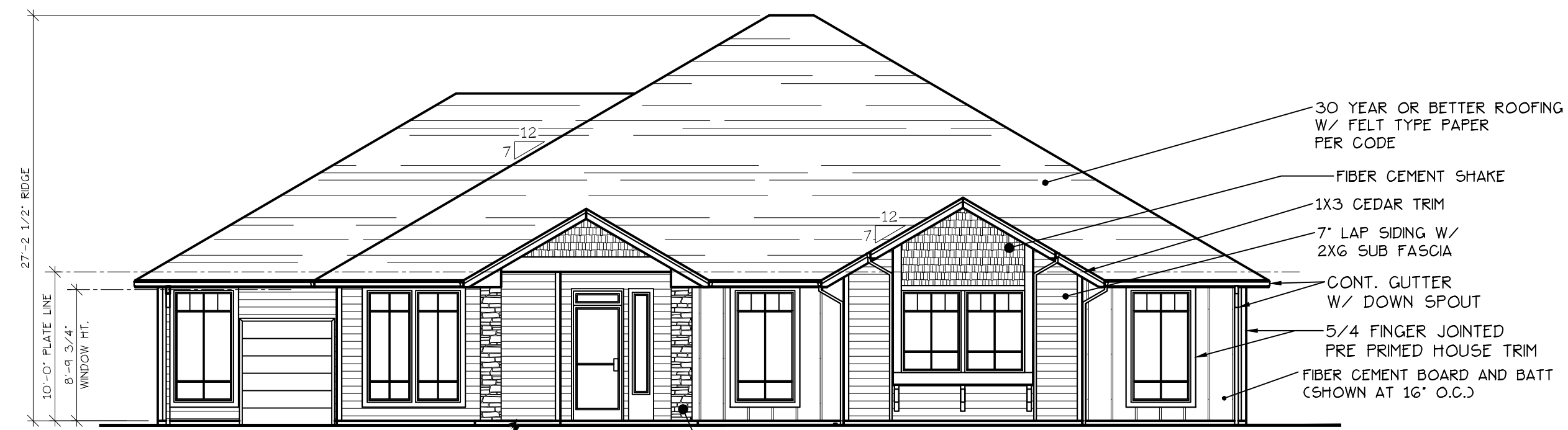
WEST ELEVATION (RECREATION BLD. 12) SCALE: 1/8" = 1'-0"