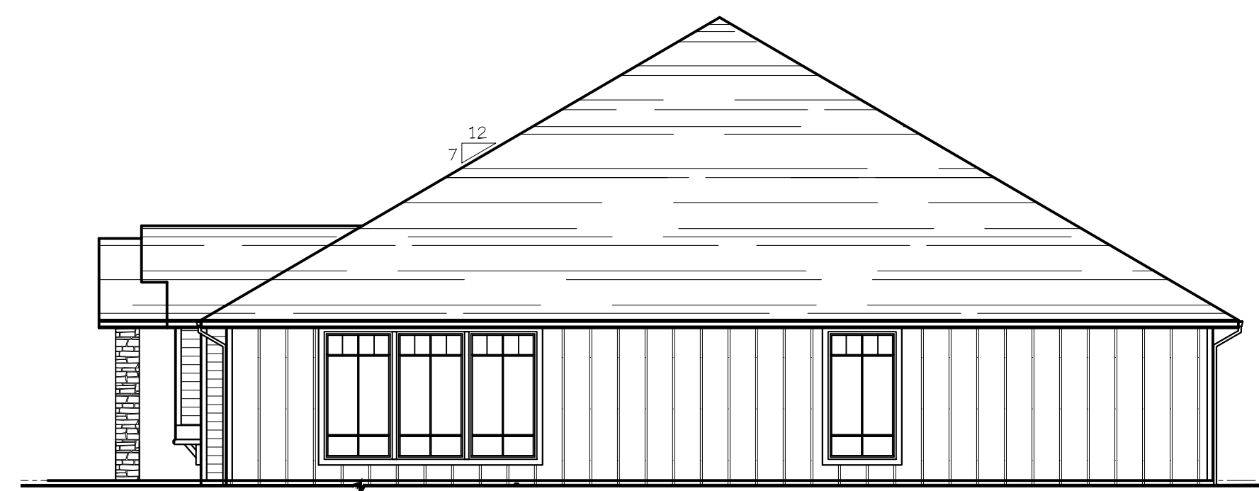
SOUTH ELEVATION (RECREATION BLD. 12) SCALE: 1/8" = 1'-0"