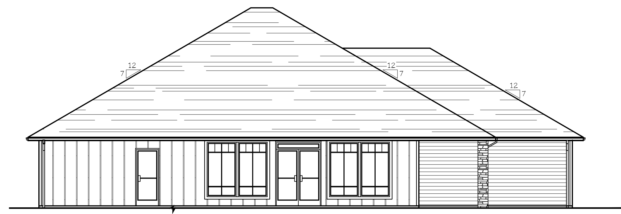
EAST ELEVATION (RECREATION BLD. 12) SCALE: 1/8" = 1'-0"