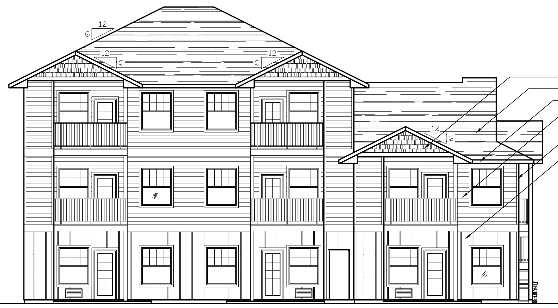
SOUTH ELEVATION (TYPE C UNITS) SCALE: 1/8" = 1'-0" BLD. 17