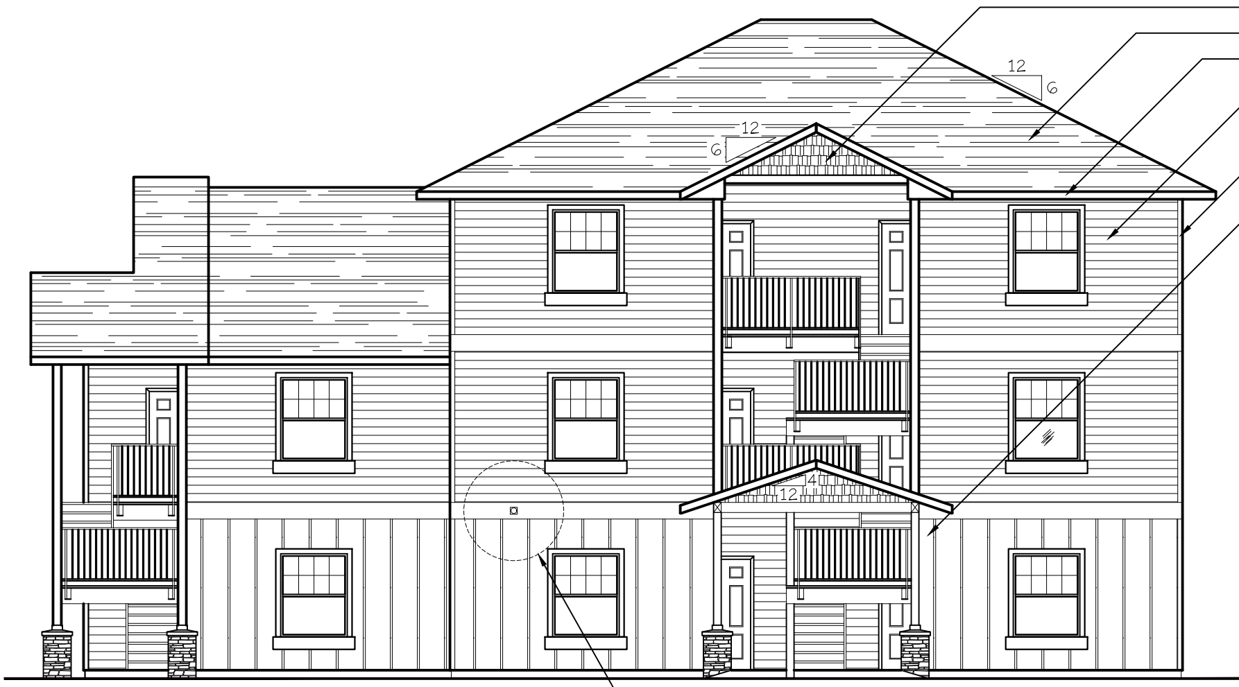
NORTH ELEVATION (TYPE C UNITS) SCALE: 1/8" = 1'-0" BLD. 17 EXHAUST VENT 3'-0" CLEAR OF OPERABLE WINDOW AREA TYP.