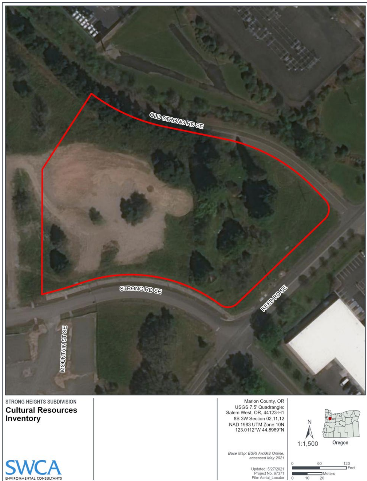
Figure 1. Aerial view of the project vicinity with the project area delineated in red.