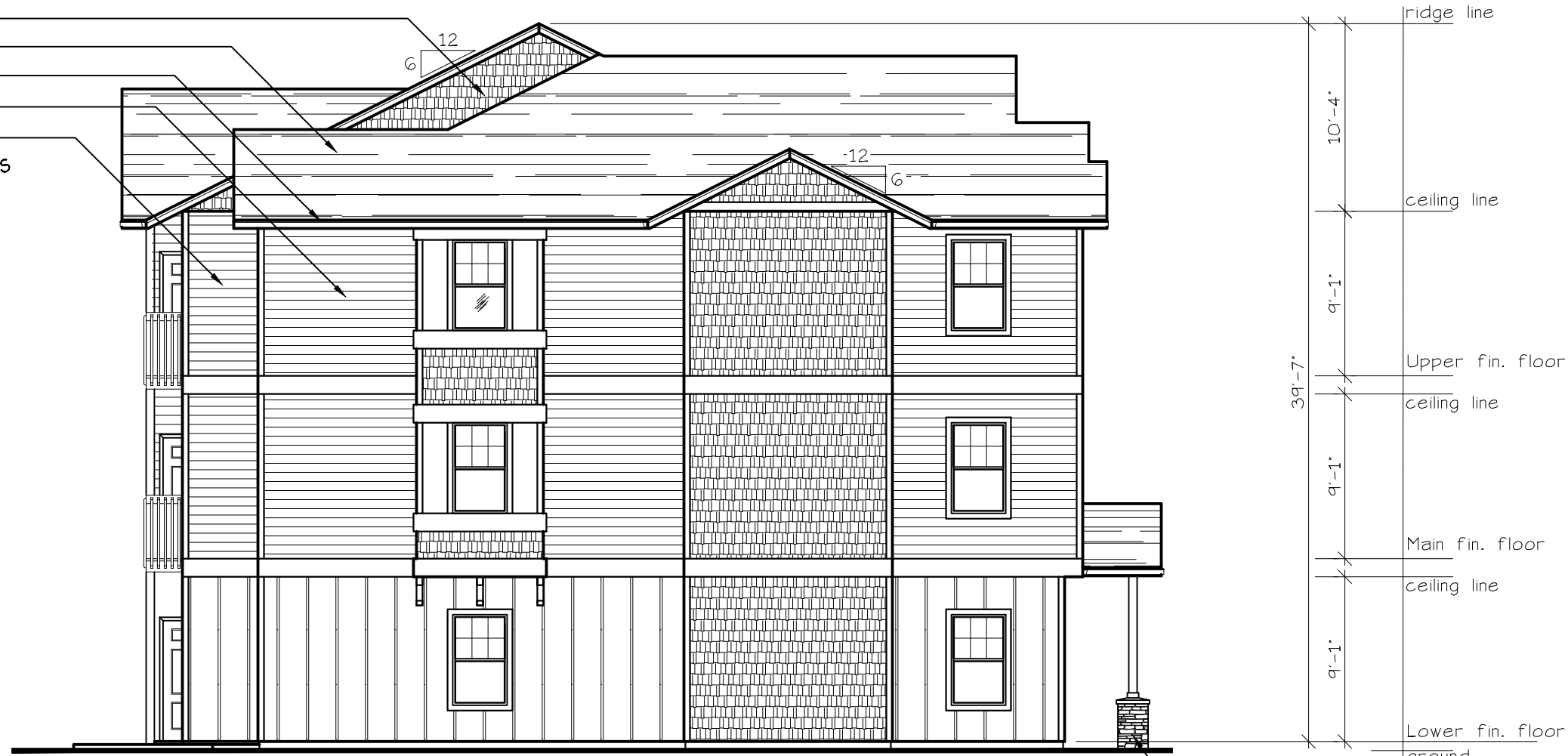
TYPE B UNITS SOUTHWEST ELEVATION (BLD. 33) SCALE: 1/8" = 1'-0"