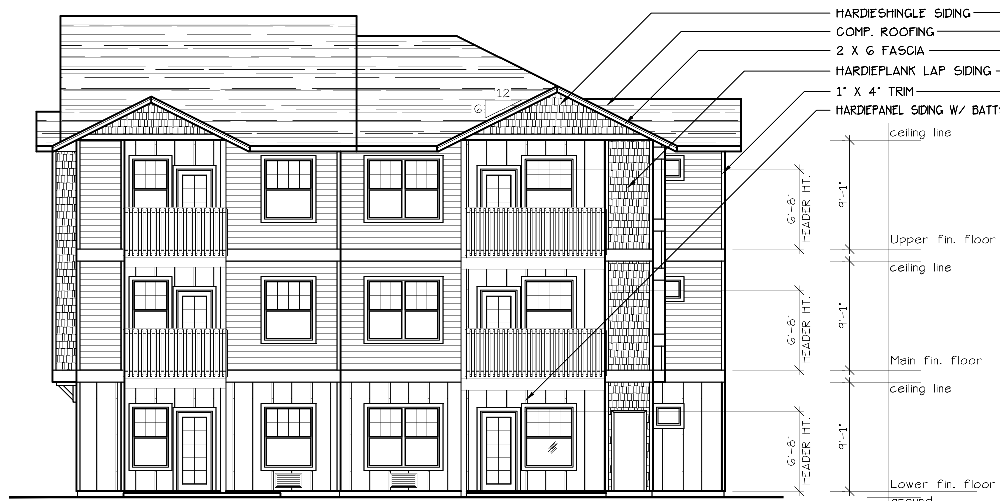
TYPE C UNITS | TYPE B UNIT | NORTHWEST ELEVATION (BLD. 33) SCALE: 1/8" = 1'-0"