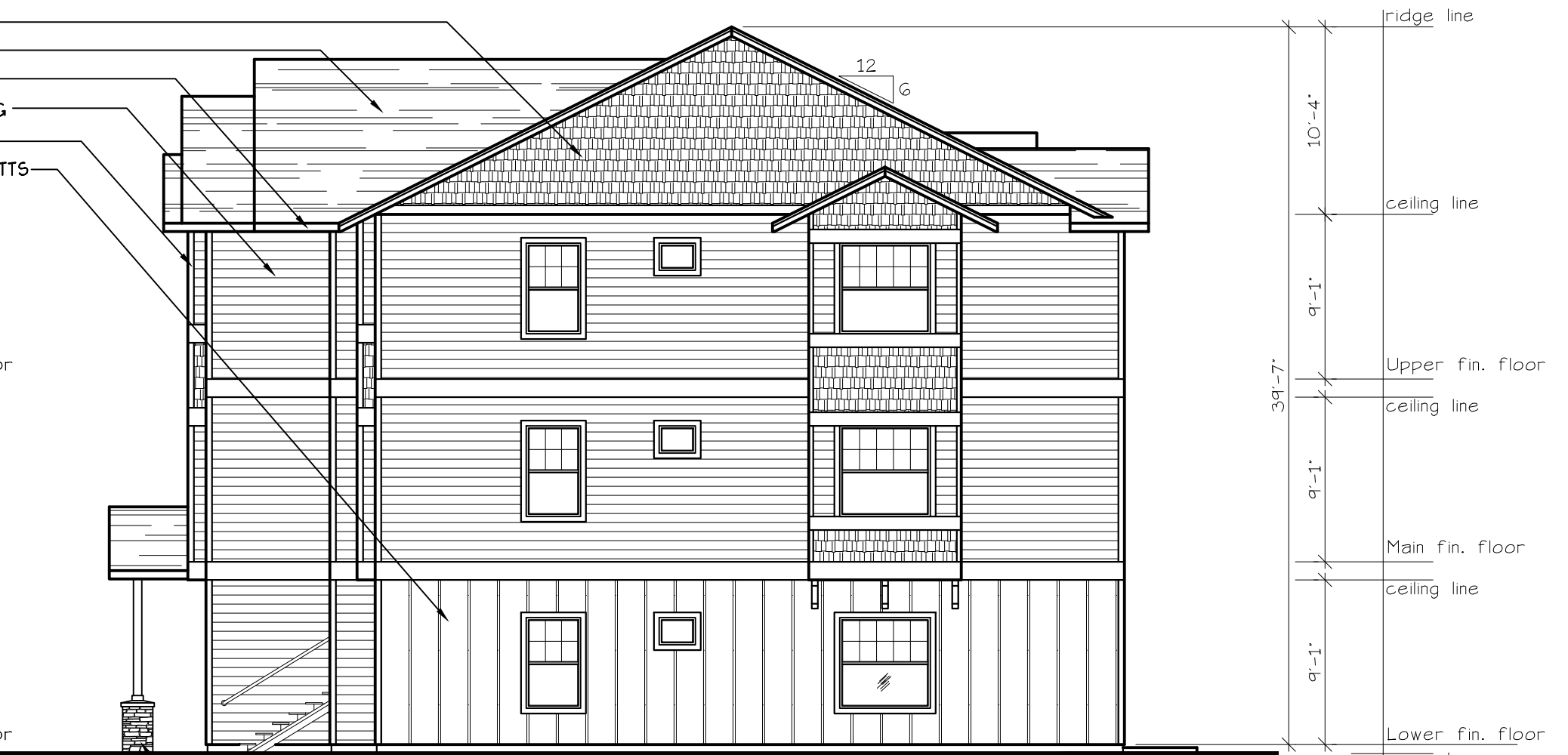
TYPE C UNITS NORTHEAST ELEVATION (BLD. 33) SCALE: 1/8" = 1'-0"

NO CHANGES, MODIFICATIONS OR REVISIONS TO BE MADE TO THIS DRAWING WITHOUT THE WRITTEN AUTHORIZATION FROM THE DESIGN ENGINEER. DIMENSIONS & NOTES TAKE PRECEDENCE OVER GRAPHICAL REPRESENTATION.