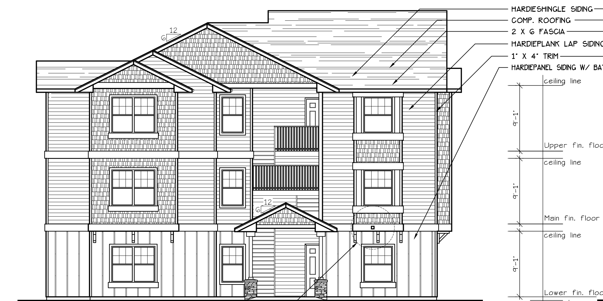
TYPE B UNIT | EXHAUST VENT 3'-0" CLEAR OF OPERABLE WINDOW AREA TYP. | TYPE C UNITS | SOUTHEAST ELEVATION (BLD. 33) SCALE: 1/8" = 1'-0"