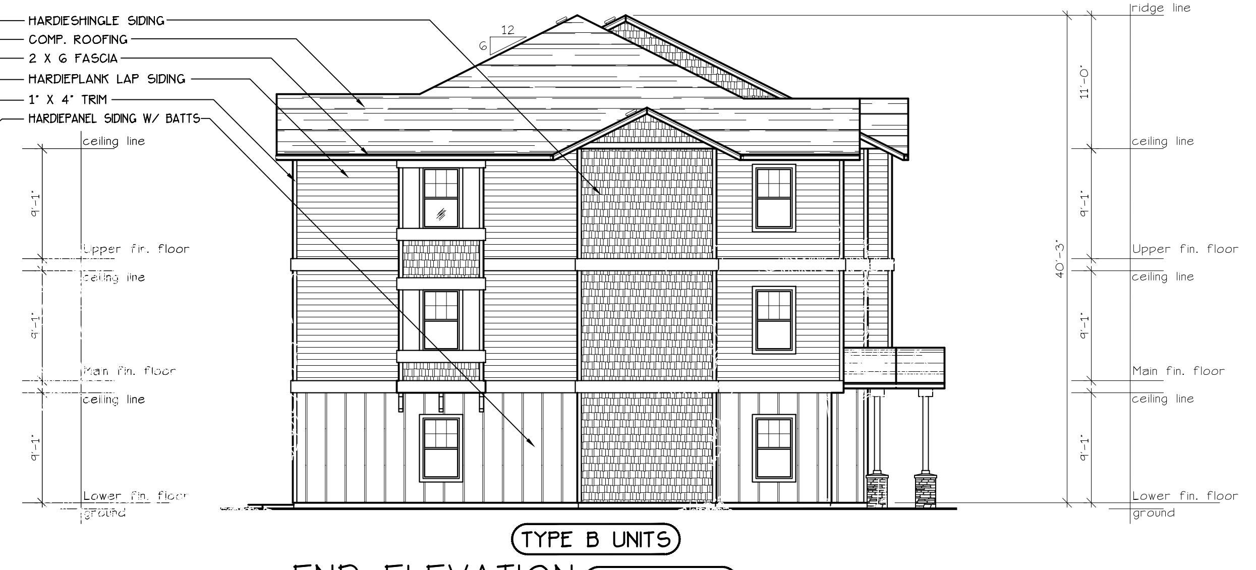
END ELEVATION (BLD. 23+35) SCALE: 1/8" = 1'-0"