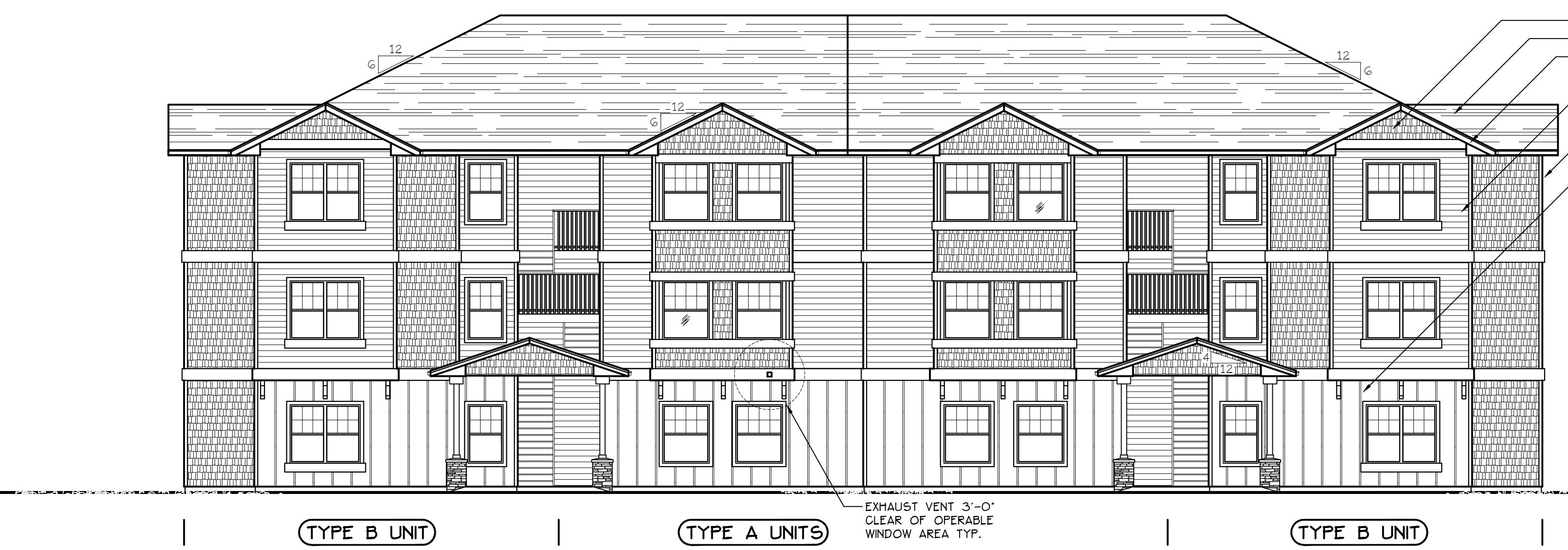
FRONT ELEVATION (BLD. 23+35) SCALE: 1/8" = 1'-0"