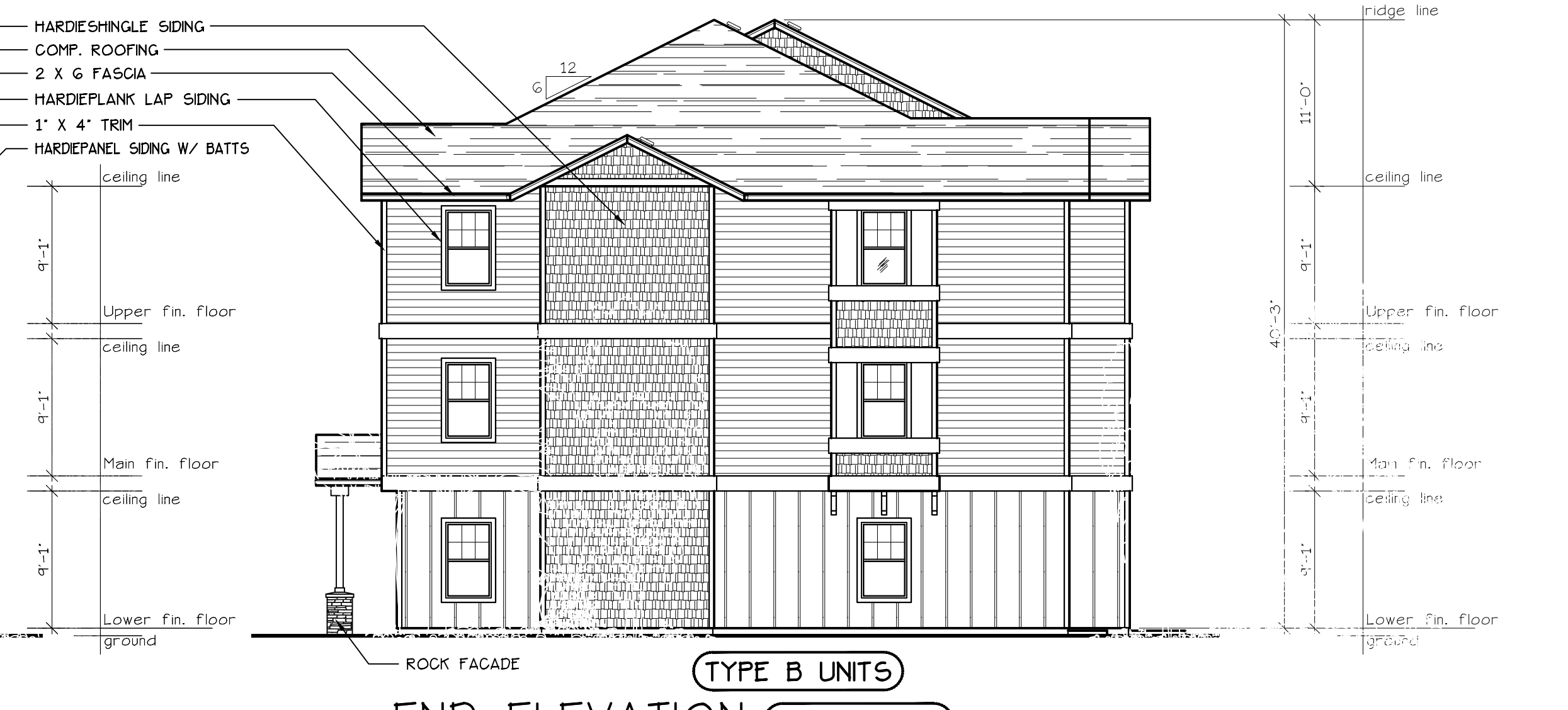
END ELEVATION (BLD. 23+35) SCALE: 1/8" = 1'-0"

HARDIESHINGLE SIDING COMP. ROOFING 2 X 6 FASCIA HARDEPLANK LAP SIDING 1' X 4' TRIM HARDEPANEL SIDING W/ BATTIS