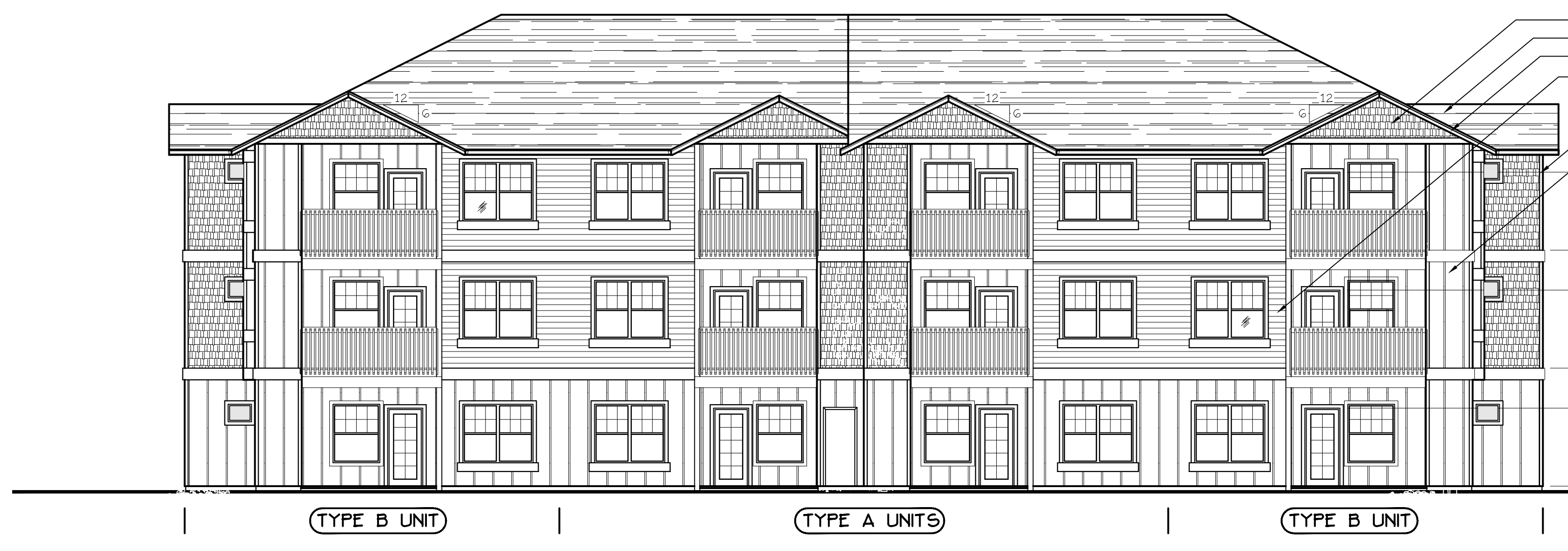
REAR ELEVATION (BLD. 23+35) SCALE: 1/8" = 1'-0"