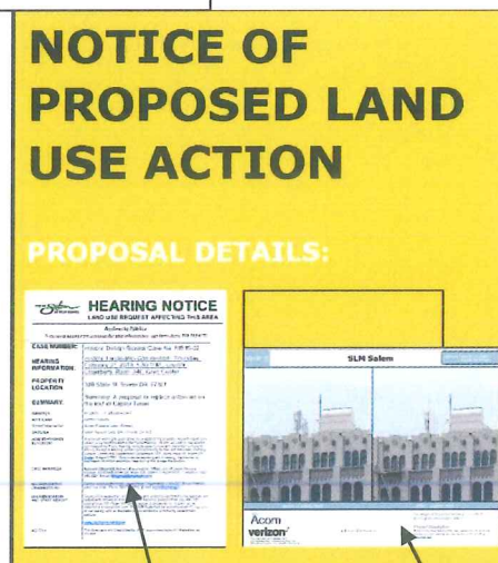
Attachment A (Hearing or Filing Notice)