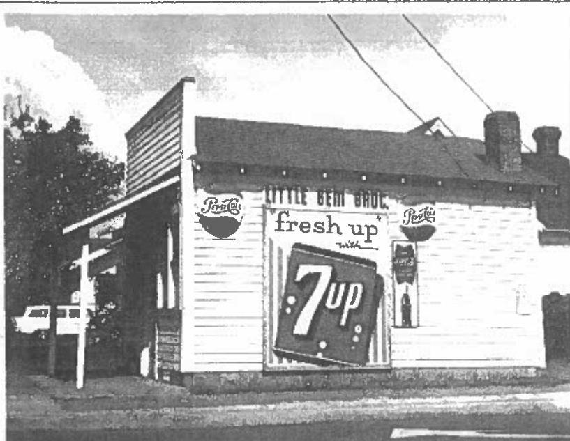
Little Gem Grocery store in Salem, Oregon The Little Gem Grocery, a "Mom and Pop" type grocery store, was located at 17th St. and Chemeketa in Salem. This tidy, little, white clapboard building sports advertising signs for 7Up, Pepsi-Cola, and Coca-Cola.