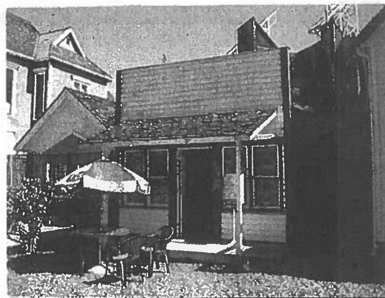
Little Gem Grocery on September 10, 2006