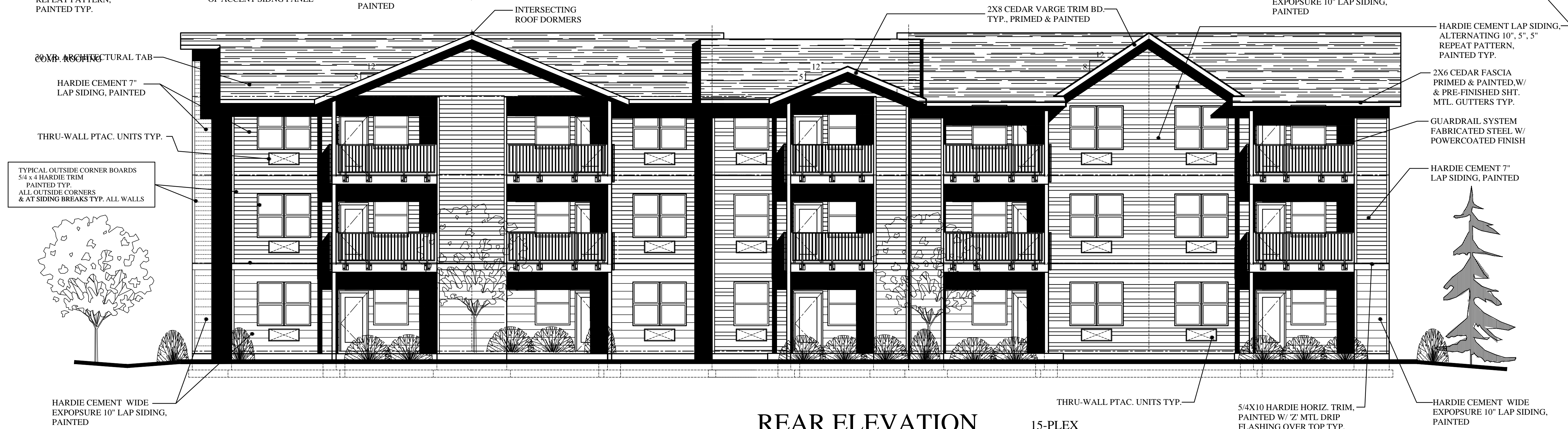
REAR ELEVATION 15-PLEX