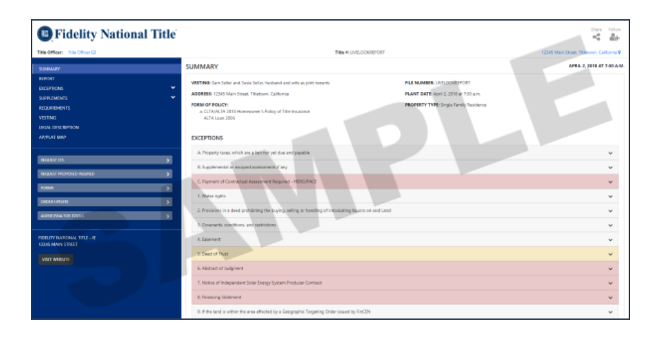
Effortless, Efficient, Compliant, and Accessible

To view your new Fidelity National Title LiveLOOK report, Click Here