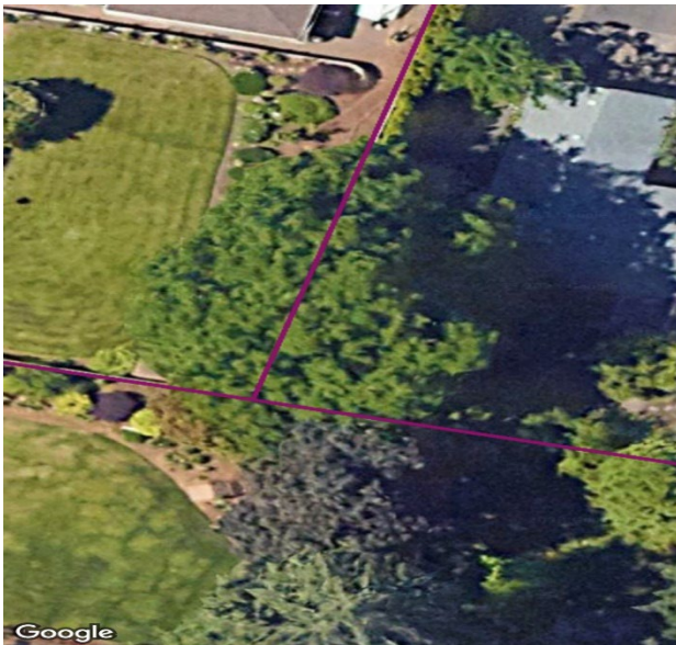
Google Earth photo shows full/dense tree canopy

These two photos show a stark contrast in the tree canopy from Google Earth photo and photo taken this past week. As evidenced by the photos, there is a remarkable difference in the tree canopy and overall health of the tree: